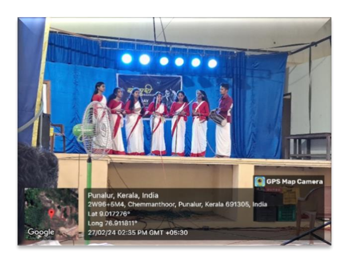
Equal participation of students in arts, and cultural events