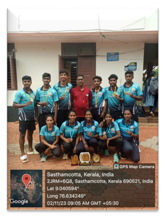
Equal participation of students in sports