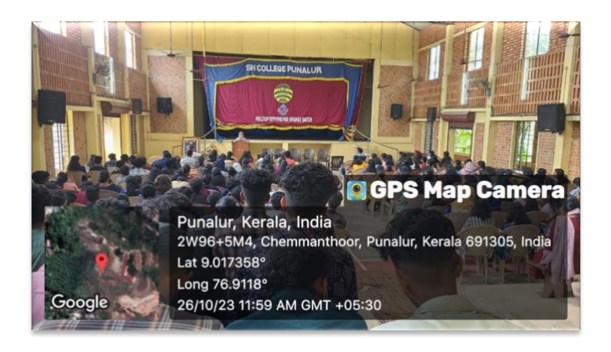
Orientation Programme for I year students