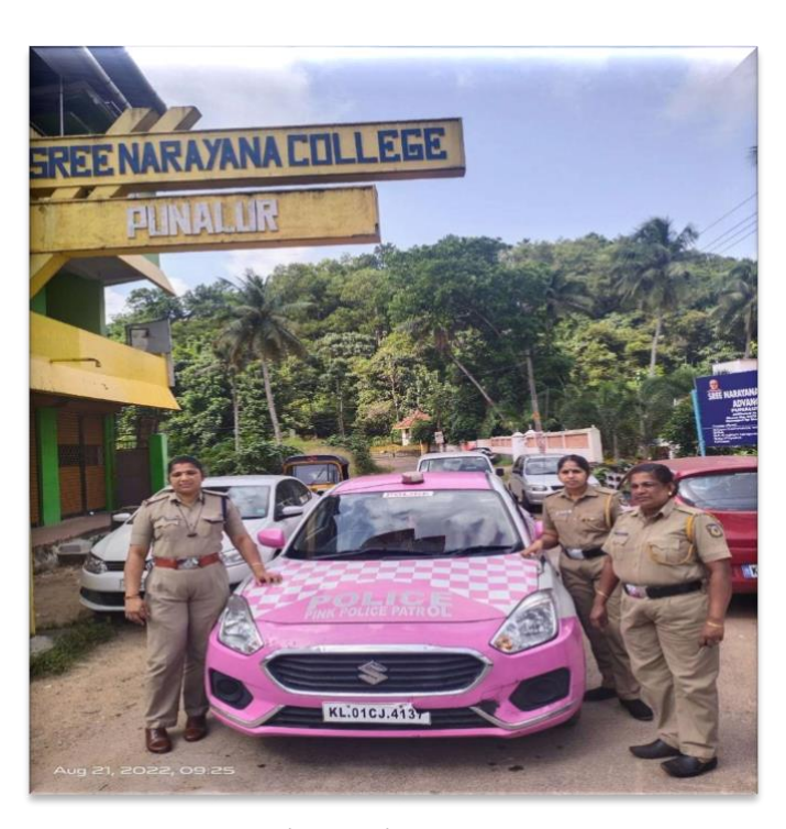
Pink Police Patrol