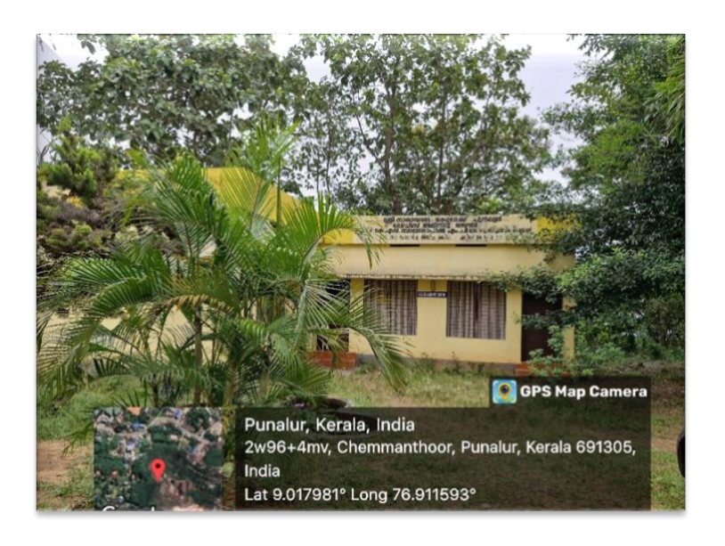
Women's Amenity Centre