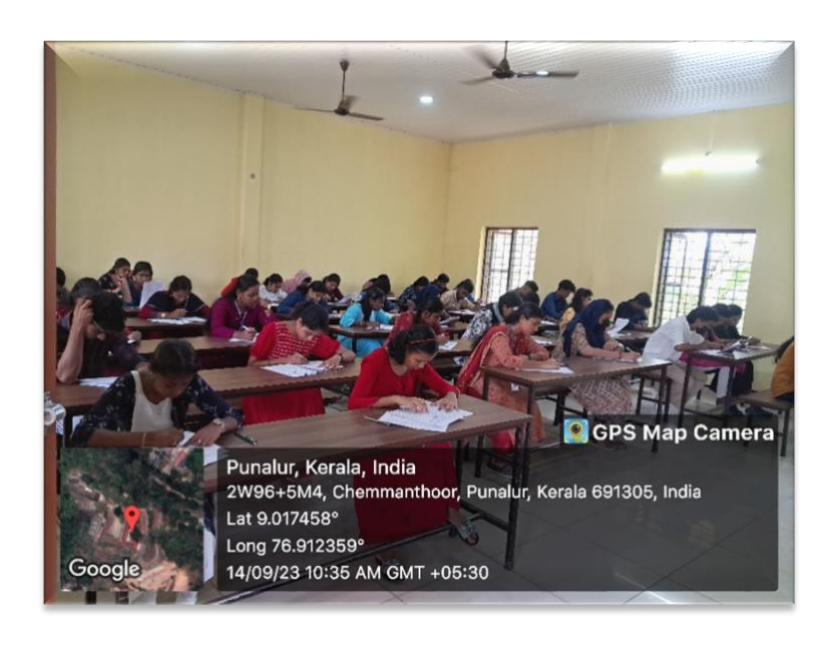
Gender equity inside classroom