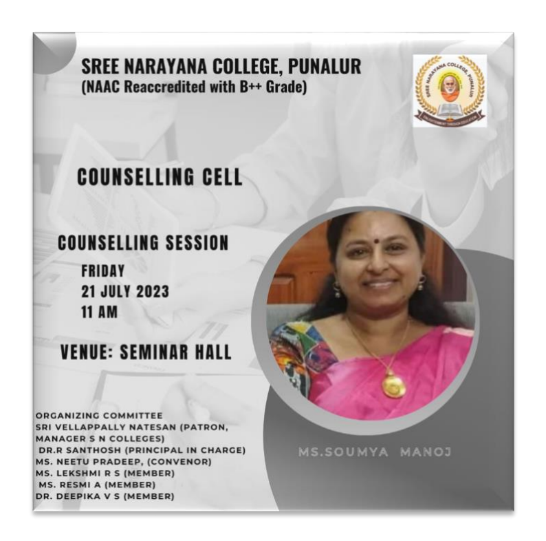
Brochure of the Counselling Programme