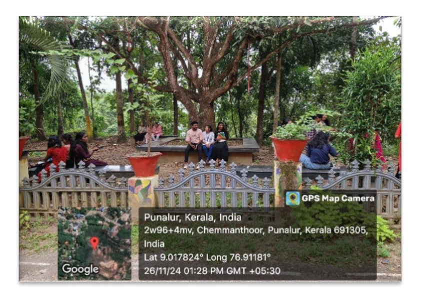
Common Spaces used by all students